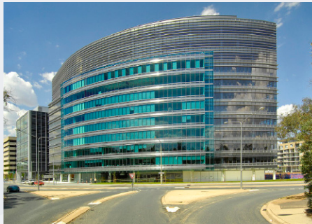
7 London Circuit &

This Harry Seidler designed building sits in the Parliamentary Triangle in Barton close to Parliament House. It is to be the new headquarters for the Australian Federal Police from the end of 2009. The new AFP Headquarters will accommodate over 2000 staff in A Grade Quality office accommodation. Extensive work to the buildings services are being carried by Quick Plumbing including the connections to major services in the surrounding streets.